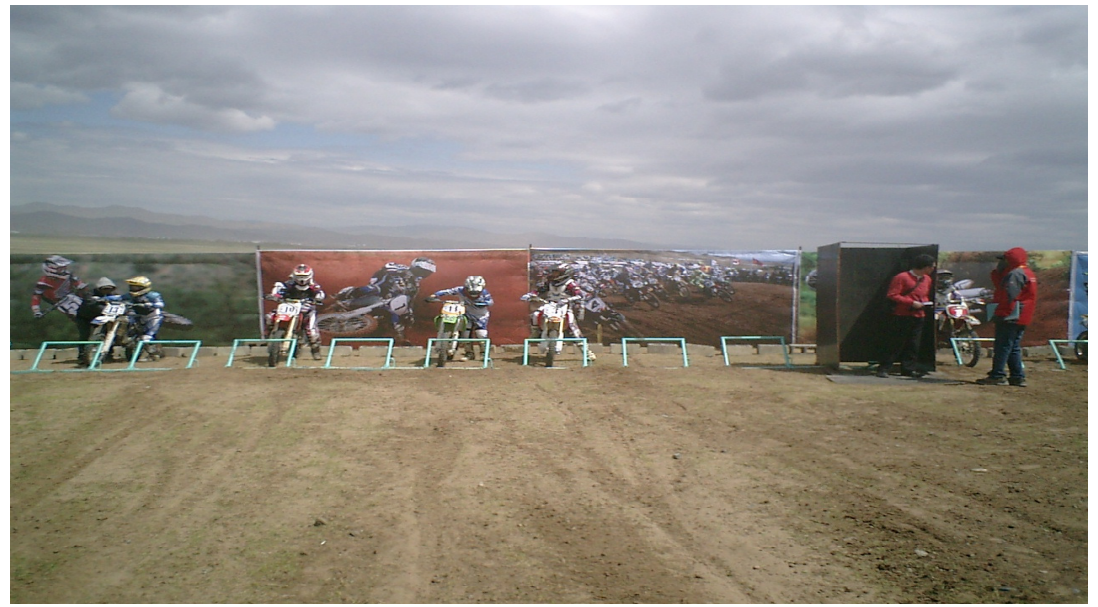
Junior 85cc line up

Moto 2 15.15pm Junior 85cc 15\min + 2 laps An almost mirror image of Moto 1, except this time Khishignyam held top spot for the entire race with all the youngsters maintaining their positions excepting Gennadii and Erdenepurer who were lapped on the penultimate lap of the 15min + 2lap Moto. 1<sup>st</sup> Khishignyam 2^{n\hat{d}}