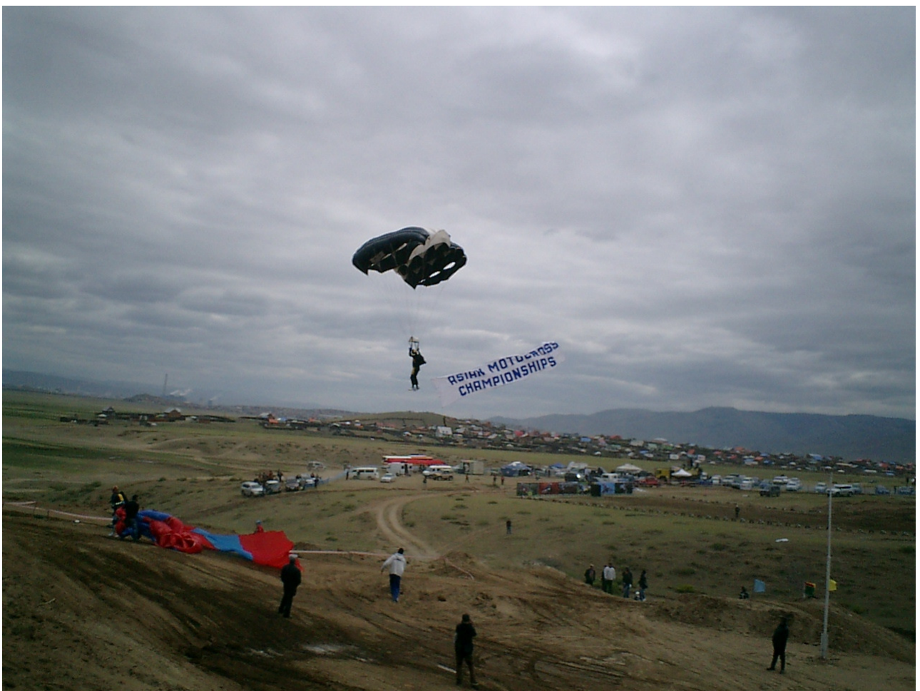
MAMSF produced an excellent opening ceremony complete with parachutists who defied the windy conditions to thrill the onlookers scattered around the 2,300 meter circuit.

The small core of AMSC personnel swung into action on Sunday Race day with the experienced Arthur Valdez from the Philippines overseeing track organization. The track had been watered but the result was not optimum.